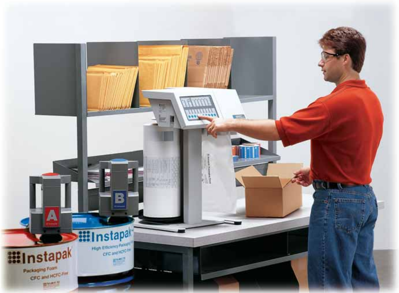
Workbench, Instapak® chemical drums and film not included.